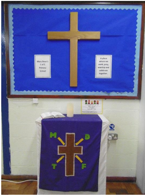
The altar is a focal point for assemblies.